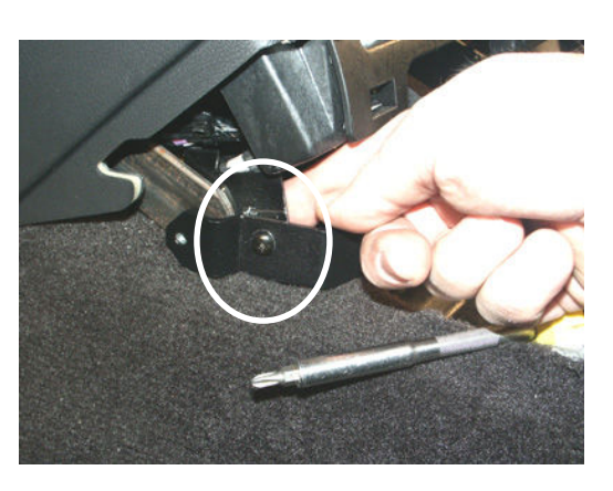
Attach frame support bracket (#4) to vehicle using 10/32 x ½" phillips machine screws, washers, and keps nuts